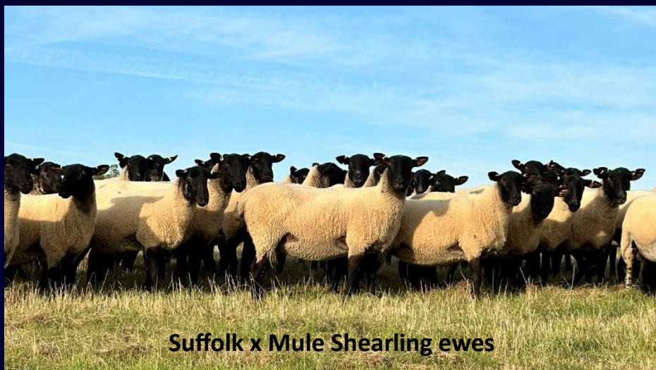
Suffolk x Mule Shearling ewes

“The first 600 lambs from this flocks 2024 lamb crop averaged £185”